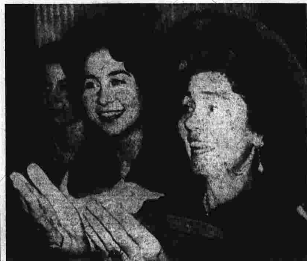
Royalty at Paris Fashion Show Queen Frederika of Greece, right, and her two daughters, Princess Irene, left, and Princess Sophie, are shown at opening today of the Paris spring and summer fashion showings of Jean Dessès. The presentation was on theme of youth inspired by Princess Sophie, Dessès has designed the wedding dress and trousseau for Princess Sophie, who is marrying Prince Juan Carlos of Spain.

By THE ASSOCIATED PRESS Eccentric winter hit Southern California with snow and freezing temperatures today after whitening San Francisco with its first measurable snowfall in 30 years. Bitter cold with readings ranging down to 42 below zero blanketed wide sections of the north central portion of the country. Snow fell on the Hollywood, Calif., freeway and spread a wet white cover on the Los Angeles Studio City, North Hollywood, Sherman Oaks, Woodland Hills, Chatsworth and Northridge. The snowfall was the first of any consequence in the Los Angeles area in 13 years. Northbound traffic was held up on U.S. 99 north of Los Angeles by snow and stalled vehicles. Temperatures dipped to 30 degrees at Palmdale, 35 in Burbank, 40 in downtown Los Angeles, 34 in Riverside, 36 in Bakersfield and 24 at Mt. Wilson. In Hozeman, Mont., the mercury fell to -42. Drummond, Mont., reported -40; Rawlins, Wyo., -34 and Denver -14. The cold extended eastward to Iowa where Lemars had a -13 reading. Some higher elevations in the Rockies had 18 inches of new snow. Considerable fog blanketed most of Georgia, the western Carolinas, northern Florida, eastern Alabama and parts of eastern Tennessee. The fog forced suspension of jet plane travel at the Atlanta airport. Temperatures on the Pacific coast ranged from the 20s to the 30s in the central and northern portions, and in the 30s and 40s in the south. In the Southwest, readings were: (Continued on Page Eight)